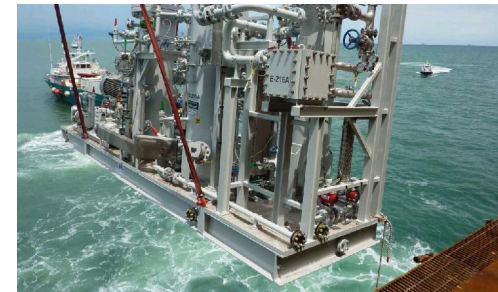
Fuel gas compressor