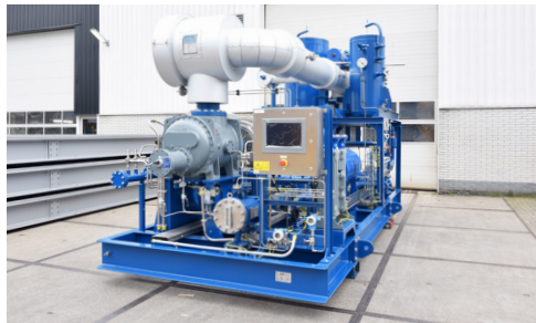
Vapor recovery unit