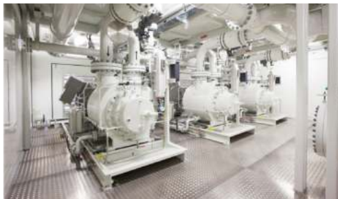
Triple MR station