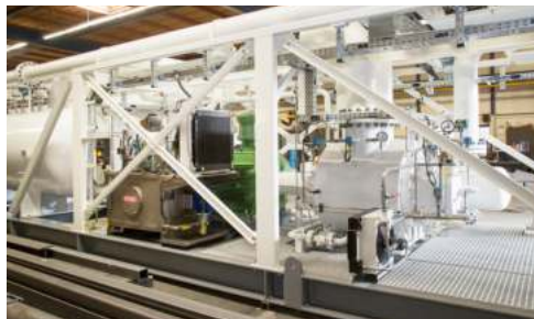
Mature well development up to 100 %GVF